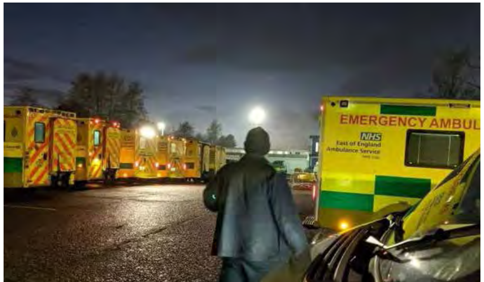
While NHS staff battle to cope with Covid – consultants are creaming off £1,000 per day

In 2016-17 the King’s Fund found that management consultants were being used to support the development of STPs in three out of four areas: and firms including McKinsey were employed again and again at a combined cost of over £80m in the long running fiasco of the Shaping a Healthier